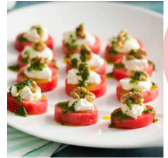
Watermelon canapés with whipped feta and walnuts