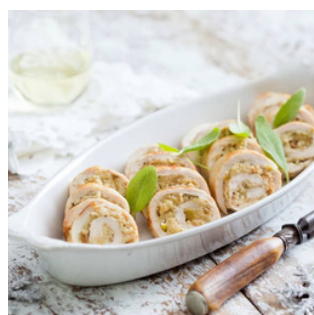
Turkey breast roulade with apple and sage stuffing