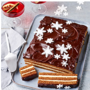
Spiced Polish Christmas cake