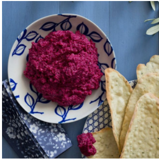
Beetroot, Parmesan and cashew dip