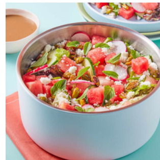
Watermelon Salad with Creamy Balsamic Dressing and Candied Nuts