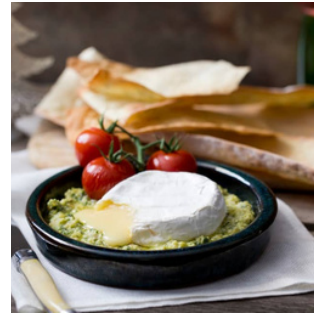
Melted Brie with basil and lemon pesto