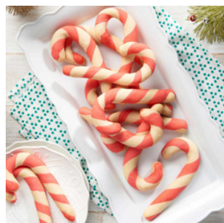
Candy Cane Cookies

*Use Cookidoo & The Shopping List for easy meal prep before Christmas comes *Use your Thermoserver to take your amazing food to your Festive parties *Please reach out if I can ever help you or someone you know regarding the Thermomix. I love nothing more than helping you get the most from your Thermomix investment Lisa