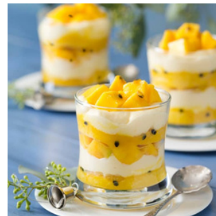
Savoirdi with mango and passionfruit