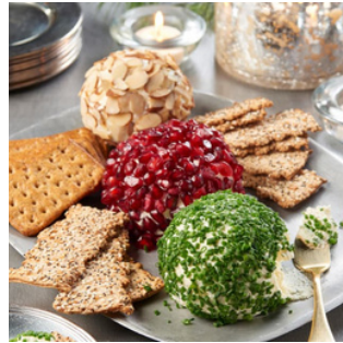
Cheese Balls Three Ways