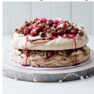
Black forest pavlova stack