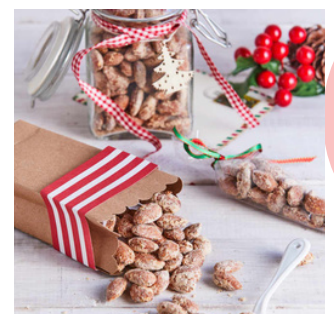
Sugar and Spice Nuts