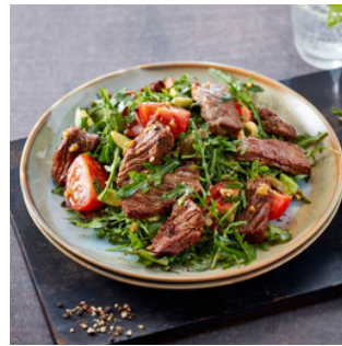
Seared steak and rocket salad