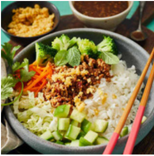
Hoisin pork bowl