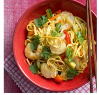
Prawn and noodle stir-fry