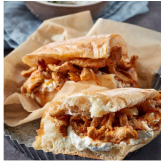
Quick Gyros with Tzatziki