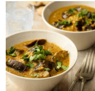
Aubergine, Coconut and Peanut Curry

Supporting you to get the most from your Thermomix