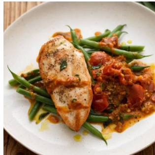
Breast of Chicken in Pizzaiola Sauce