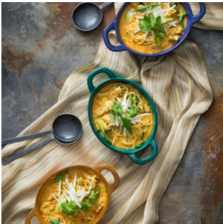
Chiang mai noodles