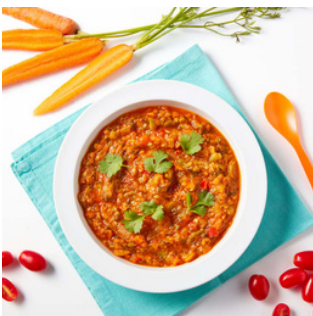
Veggie Loaded Pasta Sauce