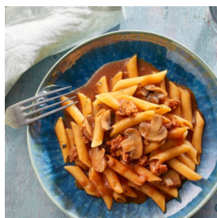
Pasta in tomato sauce with chorizo