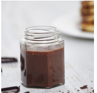
Peanut butter fudge sauce