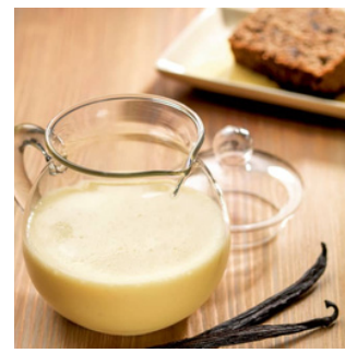
Vanilla sauce (crème anglaise)