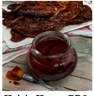
Hoisin Honey BBQ Sauce