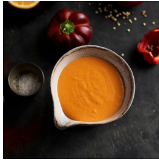
Red capsicum and paprika hollandaise sauce