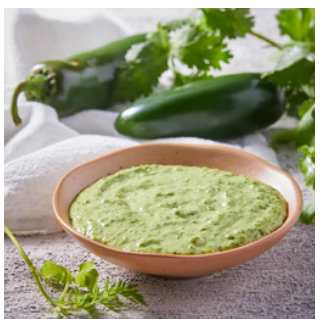
Aji Verde Sauce