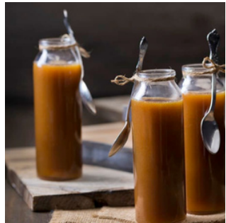
Salted caramel sauce