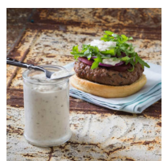
Big Mac-style sauce