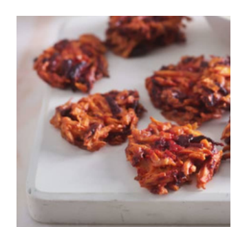
Root Vegetable Röstis