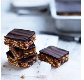
Caramel almond cashew slice