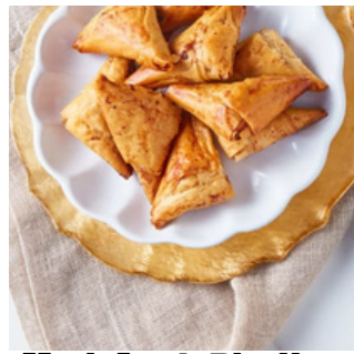
Herb Leek Phyllo Triangles