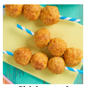
Chicken and Cheddar Meatballs