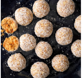
Carrot Cake Energy Balls