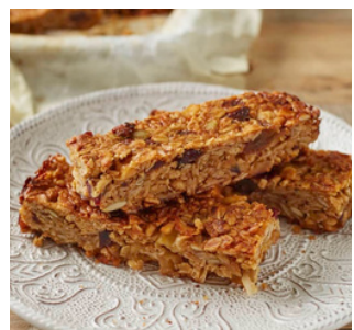
Chewy Cinnamon Apple Bars