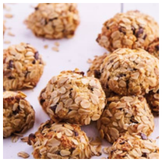
Oats, Coconut and Honey Balls