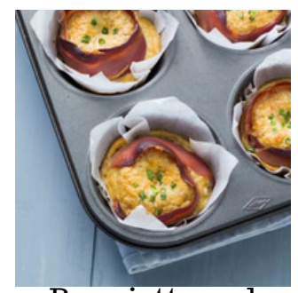
Prosciutto and basil eggs cups