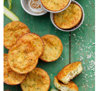
Courgette and Parmesan Muffins