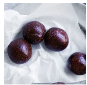
Peanut butter brownie bliss balls