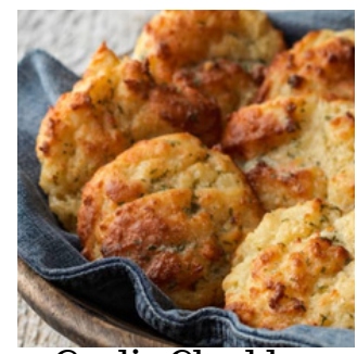
Garlic Cheddar Biscuits