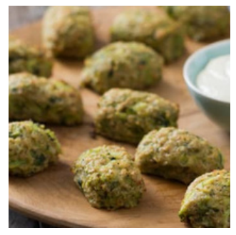
Baked broccoli bites

Supporting you to get the most from your Thermomix