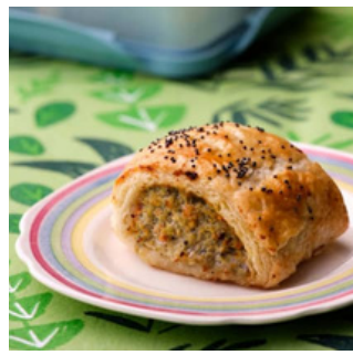
Hidden Veg Sausage Rolls