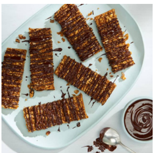
Sweet Potato Oatmeal Bars